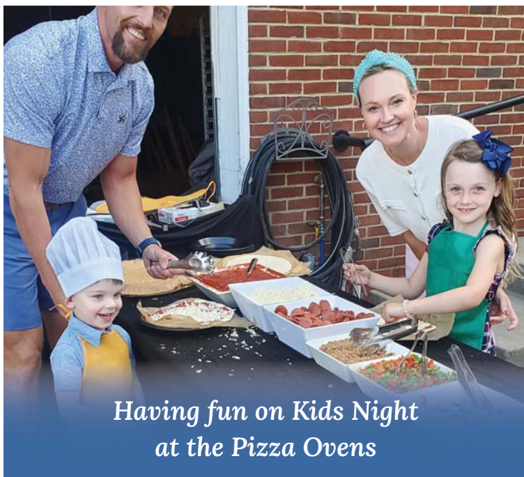
Having fun on Kids Night at the Pizza Ovens

FOR DINING & EVENT RESERVATIONS: ClubHouse Online or Beth at (412) 264-5950 or bgajewski@montourheightscc.com