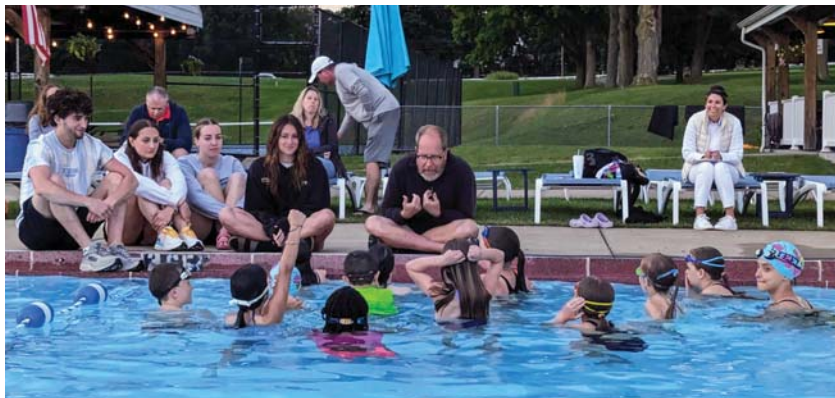
These swimmers were real troopers their first night, braving the not-so-great weather.

FOR INFORMATION, CONTACT JEFF: jberghoff@montourheightscc.com