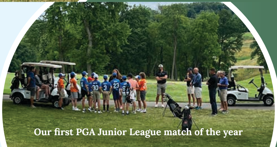
Our first PGA Junior League match of the year

The swim team won its first away swim meet of the season when the squad rolled over to Allegheny Country Club on Tuesday, June 20.